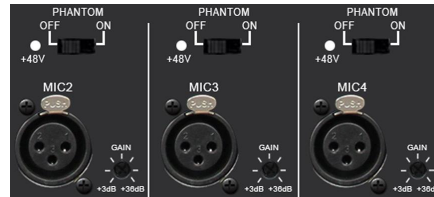
Mic Inputs with Phantom Power