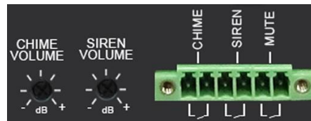
Dry contact inputs